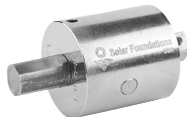
120 in-lbs Inline Preset Torque Limiter

Prices and product availability are subject to change without notice.