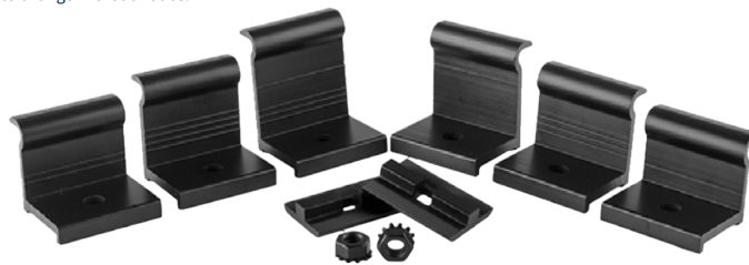
Black Panel Hardware

Prices and product availability are subject to change without notice.