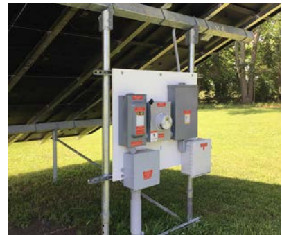
Equipment Support Column (ESC) & Mounting Hardware